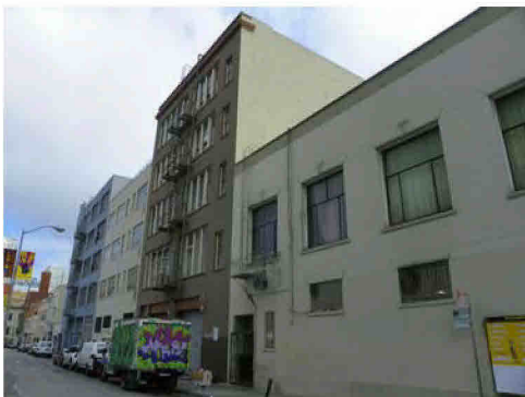
View of northwest facade. 103_4086.JPG 3/8/2011

Note: 1997 Photos no longer available, all photos by Tim Kelley Consulting